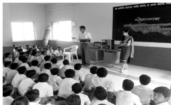
Figure 2 : A Classroom during SITAC

Undergraduate computer science students of WCE , design the contents to be delivered to rural schools, and then working in pairs or groups, visit different schools in nearby villages and aware the students and teachers about computer fundamentals, use of internet, e- learning through interactive sessions with the help of devices like laptops, DVDs, projectors, tablets like AAKASH. Students, who actually get the opportunity to handle such devices, become curious about use and study of such technology. This aims at providing the necessary hands-on practical teaching and guidance on use of computers for activities like - Word Processing using MS-Word, Analysis & Charting using MS-Excel, Accessing Mails using Outlook Express and searching the internet for useful information, apart from providing introduction to computers and associated terms.